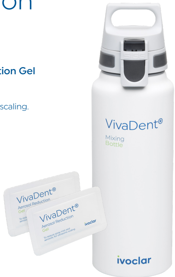
Ultrasonic scaler with Aerosol Reduction Gel

1x VivaDent Aerosol Reduction Gel Starter Kit